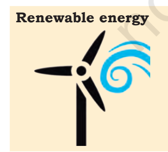
Table 5.7: Components of a Green Economy

Renewable energy from renewable resources like wind, water, sun, earth, biomass, etc., are available in large quantities and cause less pollution. India ranks amongst the top 10 countries for production of renewable energy through solar, wind and biomass.